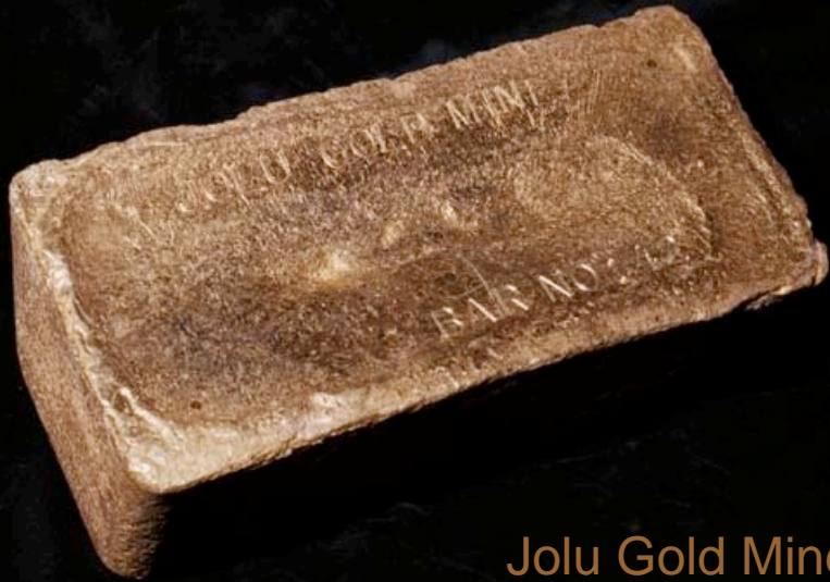
Jolu Gold Mine (1988-1991)