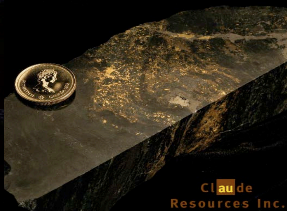
Claude Resources Inc.